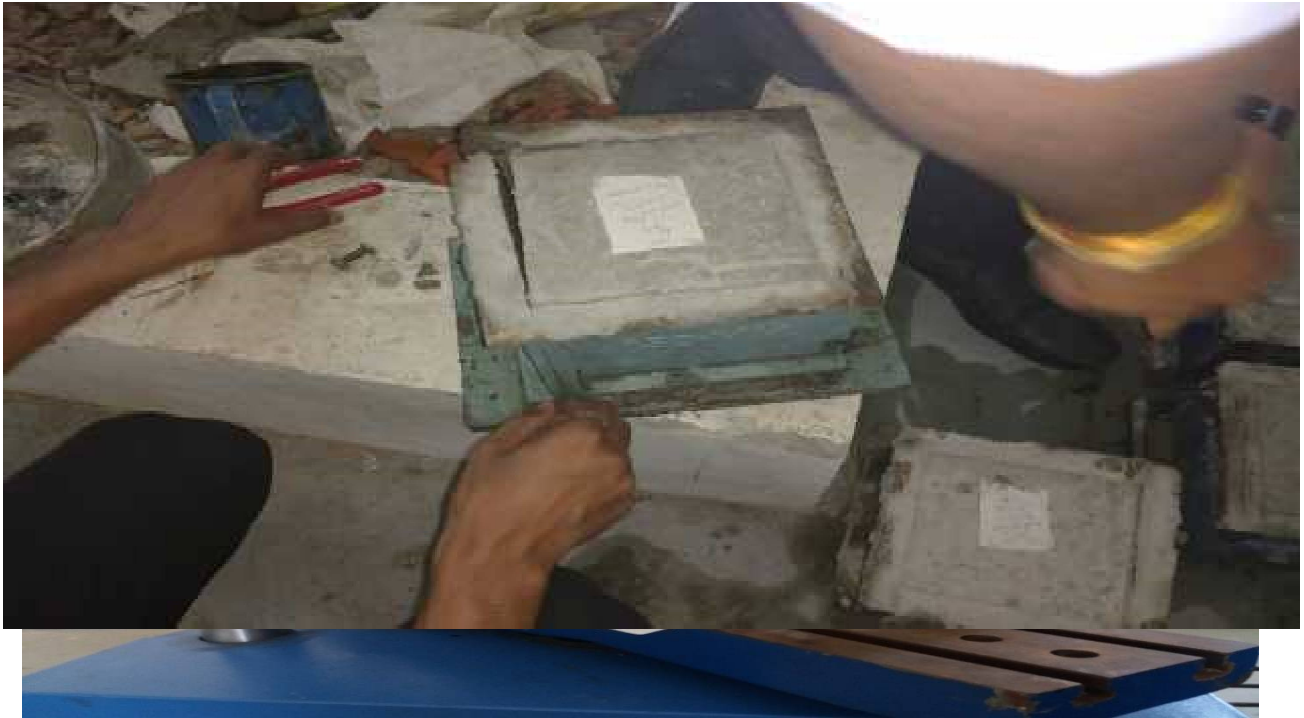
Fig.1.6 Wood Husk concrete under compression.