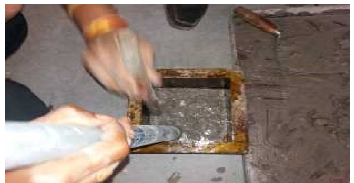
Fig. 1.4 Pouring and tempering of concrete.