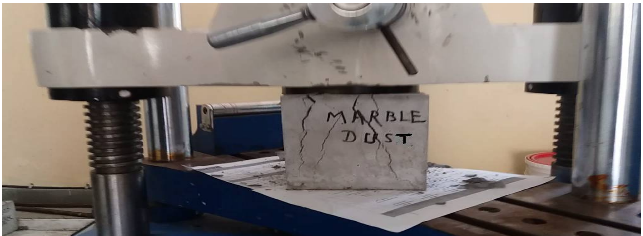
FIG.1.7 Marble Dust Ash Concrete under compression.