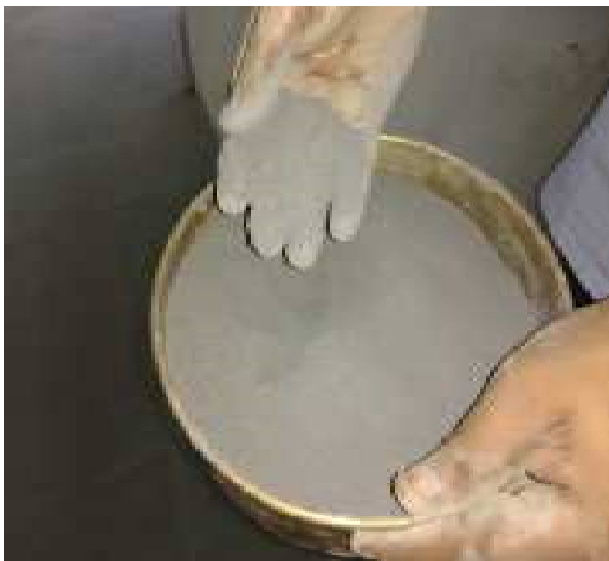
Fig 1.1 Wood Husk Ash.

These materials were mixed with ordinary Portland cement 33 grade according to IS 269, in the Concrete laboratory of Career Point University Kota, the results obtained are shared in this article. The various materials were cured for 7days and crushed after.