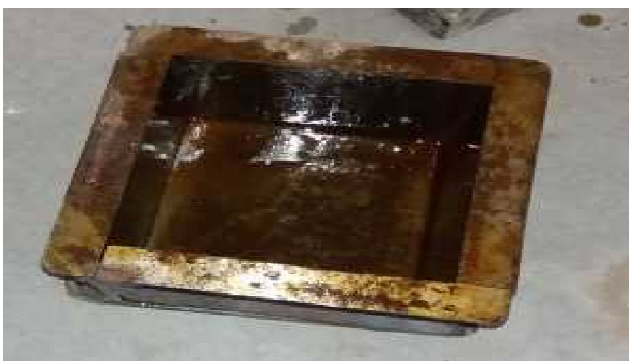
Fig. 1.3 Lubricated Standard Cube