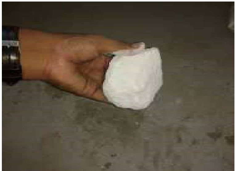
Fig. 1.2 Marble chip (Pulverized to dust)